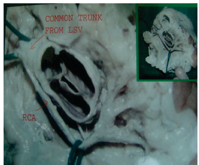
Photo 1: Showing SCA (Single coronary artery) originating from left coronary sinus and dividing in to right coronary (RCA) & left main coronary artery (LMCA)